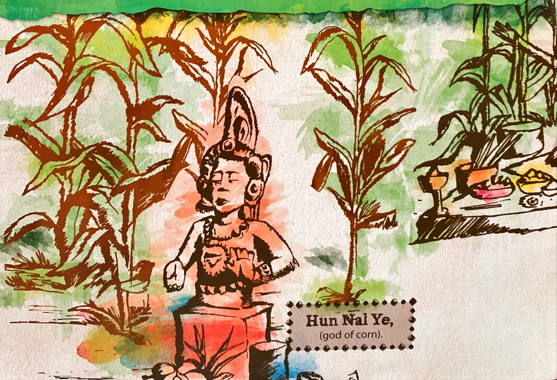
Hun Nal Ye, (god of corn).

wisdom and the greatness of this New Era. This market was a meeting point for the pilgrims that came from nearby villages to cross the sea toward Cuzamil, present day Cozumel, for trade and religious purposes but mainly to visit the shrine and oracle of the goddess Ixchel.